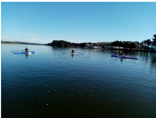
Adaptive Singles on the Oreti River

Four Athletes have attended training twice weekly, October to April - May to September weekly sessions are held at the Invercargill Rowing Club both on water and land-based training takes place.